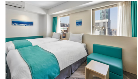
Smart Twin Room (22m 2 ) annex

We also have premium business rooms (18.48m 2 ), Hollywood twin rooms (19.47 to 20.13m 2 ), standard triple rooms (27.51m 2 ), and universal triple rooms (35.89m 2 ). (365 rooms in total)