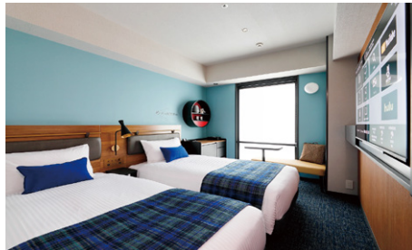
Standard Twin Room (18.48m 2 )