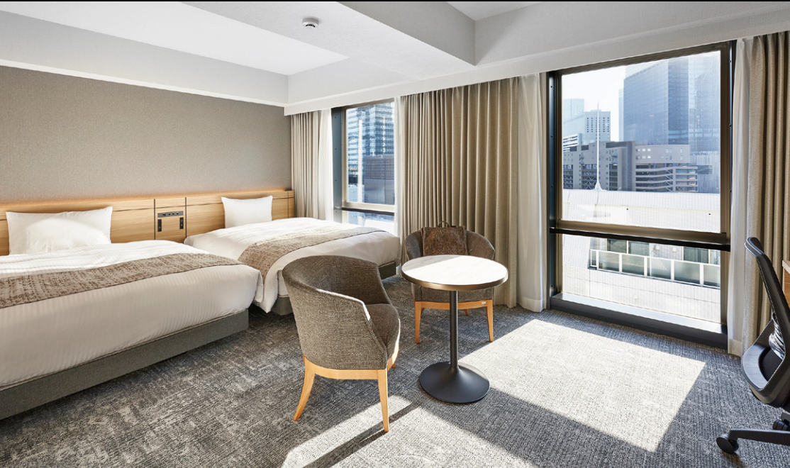
Deluxe Twin Room (36m 2 )