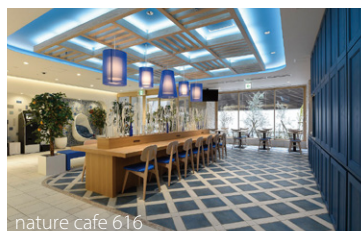
nature cafe 616