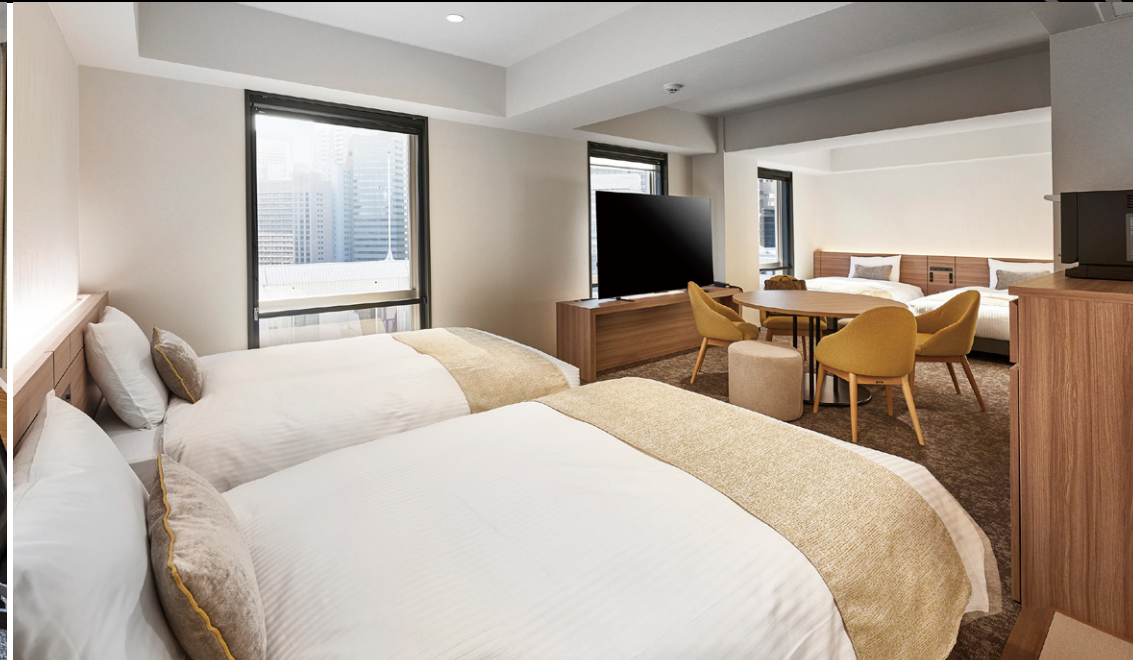
Family Fourth Room (54m 2 )