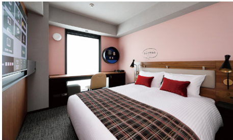
Standard Double Room (18.48m 2 )