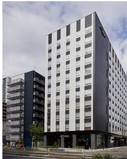
DEL style 大阪新梅田