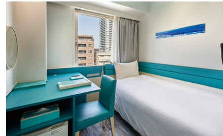
Smart Single Room (11m 2 ) annex