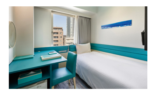
Smart Single Room (11m²) annex