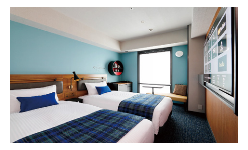
Standard Twin Room (18.48m²)