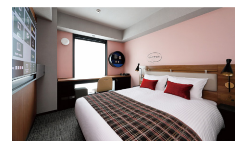
Standard Double Room (18.48m²)