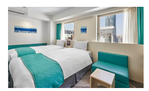
Smart Twin Room (22m²) annex

We also have premium business rooms (18.48m²), Hollywood twin rooms (19.47 to 20.13m²), standard triple rooms (27.51m²), and universal triple rooms (35.89m²). (365 rooms in total)