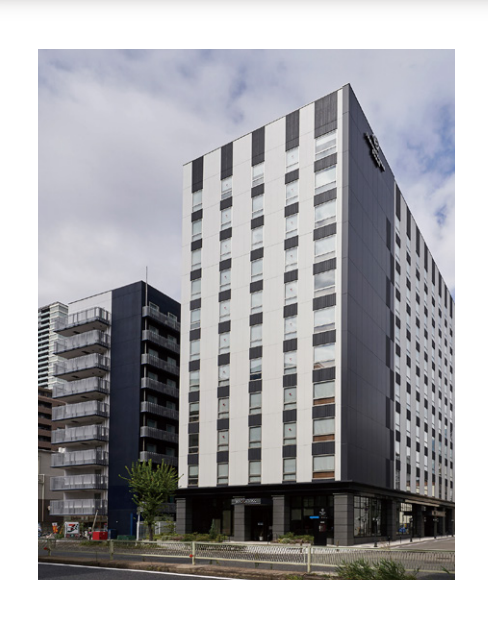
DEL style 大阪新梅田

We hope you will enjoy your stay in Osaka at DEL-style